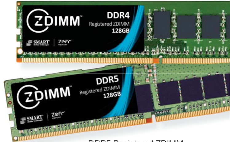
DDR5 Registered ZDIMM