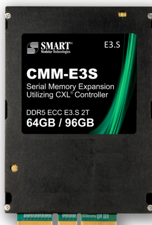
EDSFF 2T Compact Memory Modules (CMM)

Get the data center memory solution you need from SMART.